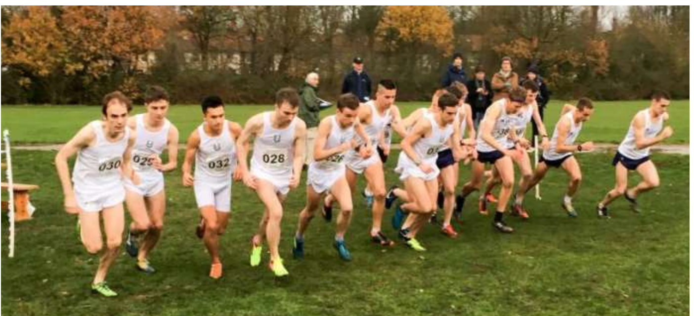
Oxford won the 128th Gentlemen's Race