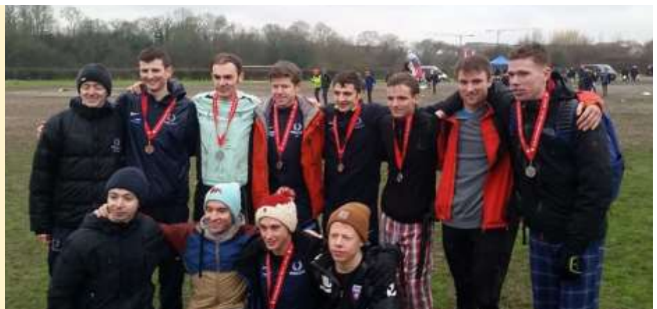
Oxford and Cambridge both made their mark at BUCS Cross Country

here short of fitness early in 2012. That and UK Athletics' draconian non-selection policy meant that, after being unable through injury to take up her selection for Beijing, she was again denied an Olympic appearance.