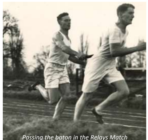
Passing the baton in the Relays Match