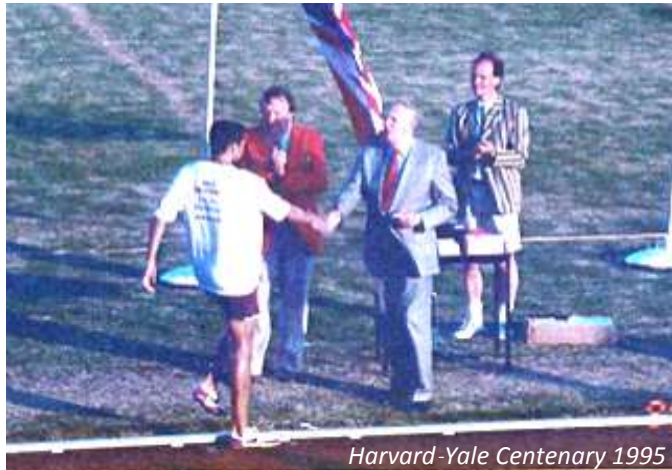
Harvard-Yale Centenary 1995

Athletes come and go, and most are soon forgotten; but everyone will always remember what Sir Roger Bannister achieved.