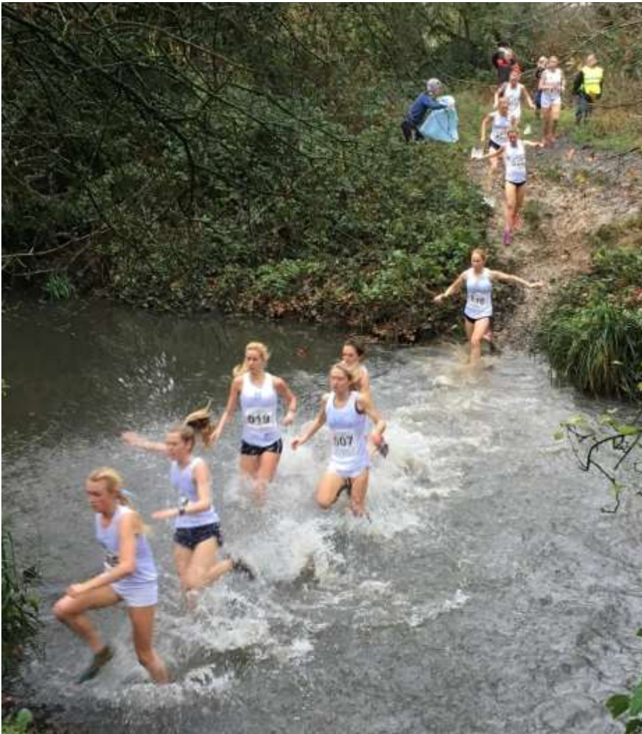
Cambridge's first win for 3 years in the Ladies' Race

Note for next year's Varsity Cross Country: we now have a Varsity Match Twitter feed @OxfCamXC and a dedicated webpage for the Varsity Match www.varsityxc.run . In the run-up to the race, we use both of these to post information (teams, preview, results, etc). Also, the Thames website has recently been updated and there is an improved page on the match: http://www.thameshareandhounds.org.uk/varsity-match/