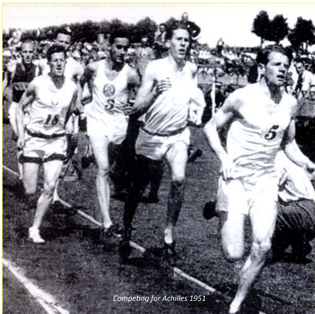
Competing for Achilles 1951