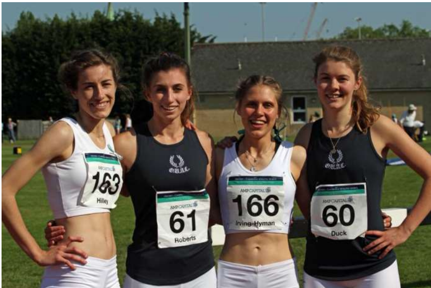
43 years after the first Women's Varsity Match, with the addition of the 200mH the men's and women's programmes are now the same..